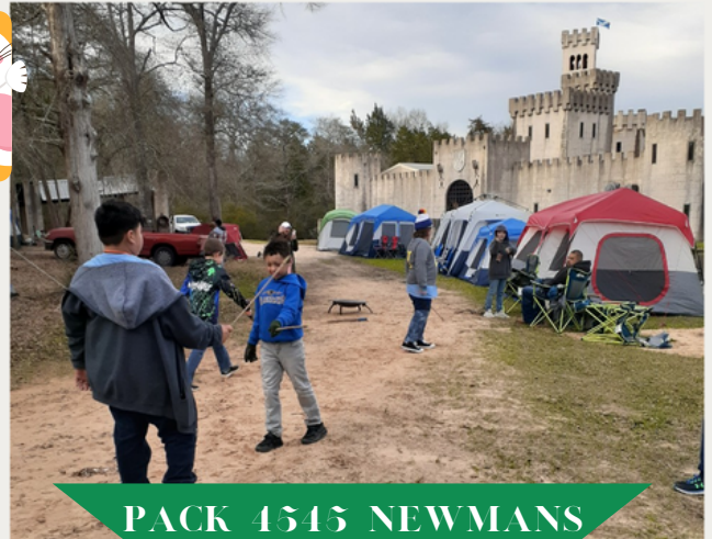
PACK 4545 NEWMANS CASTLE 2024