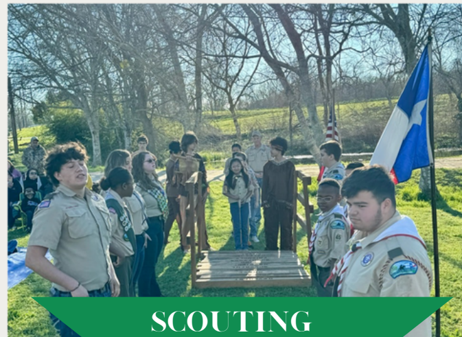
SCOUTING CROSSOVER 2024