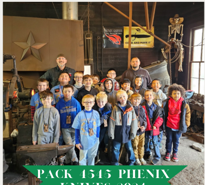
PACK 4545 PHENIX KNIVES 2024